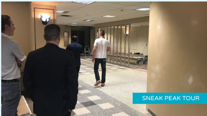
SNEAK PEAK TOUR