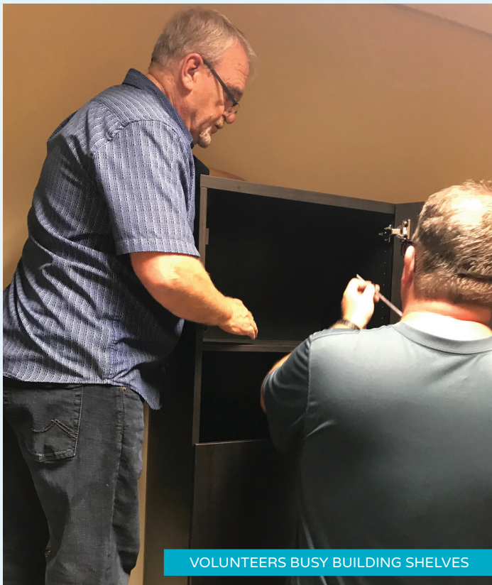
VOLUNTEERS BUSY BUILDING SHELVES