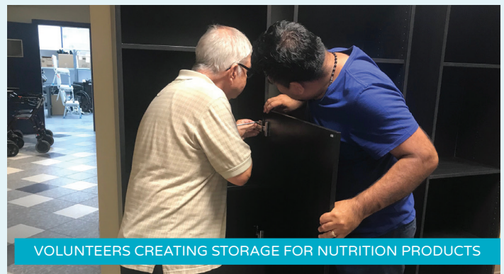
VOLUNTEERS CREATING STORAGE FOR NUTRITION PRODUCTS