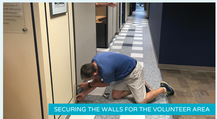
SECURING THE WALLS FOR THE VOLUNTEER AREA