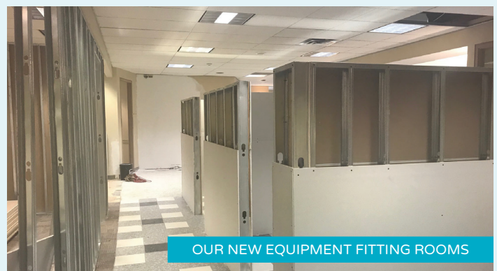
OUR NEW EQUIPMENT FITTING ROOMS