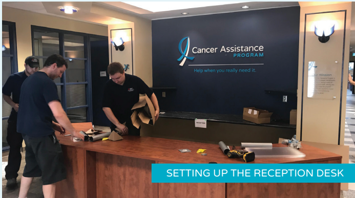
SETTING UP THE RECEPTION DESK