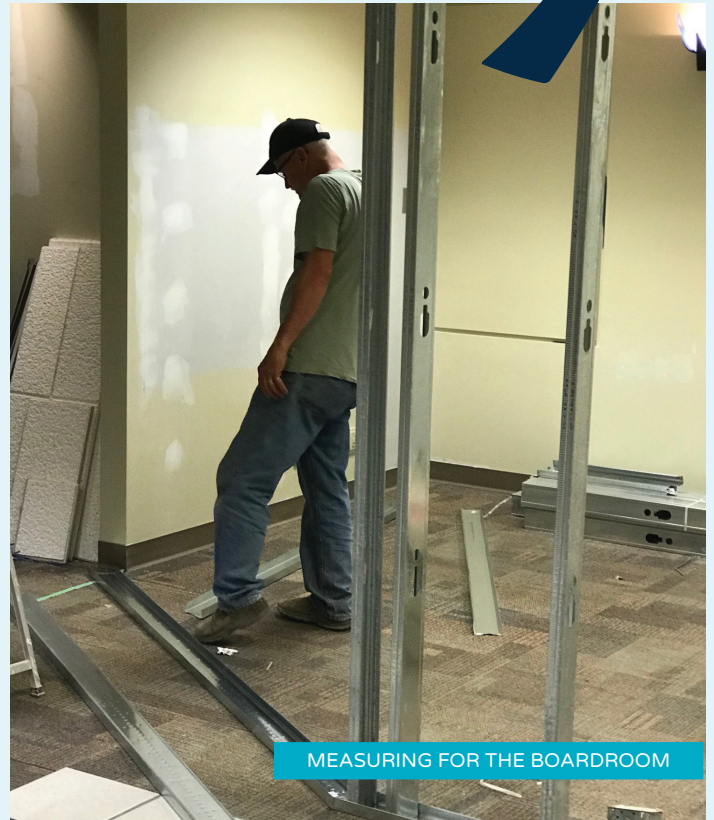
MEASURING FOR THE BOARDROOM