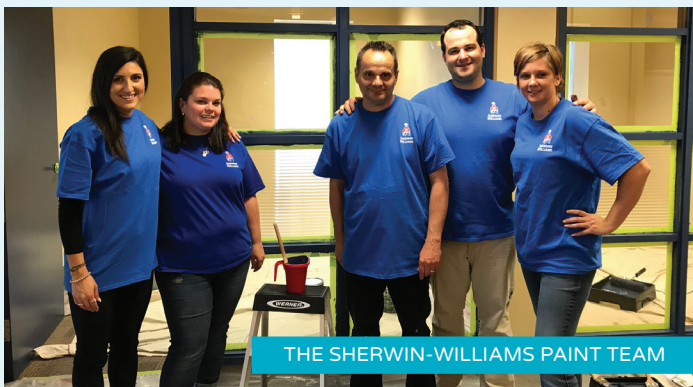
THE SHERWIN-WILLIAMS PAINT TEAM