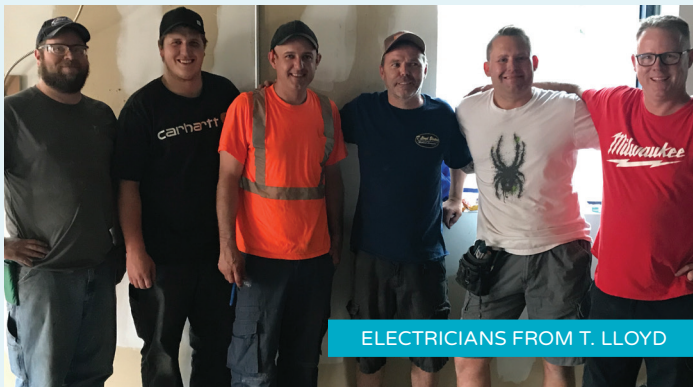
ELECTRICIANS FROM T. LLOYD