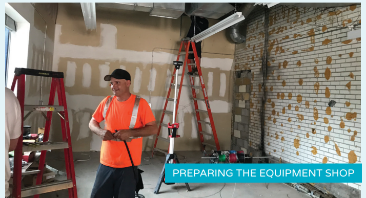
PREPARING THE EQUIPMENT SHOP