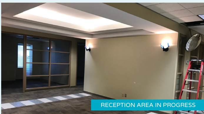
RECEPTION AREA IN PROGRESS